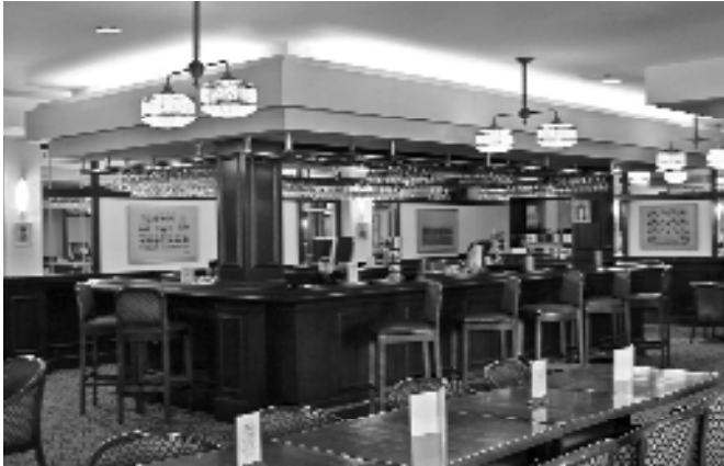
Visit the McKinley Grand for April's Business After Hours on April 16

Retreat to The McKinley Grand for April's Business After Hours on April 16, and experience first-hand the amazing amenities, excellent event service and fantastic food that comprise this one-of-a-kind luxury hotel!